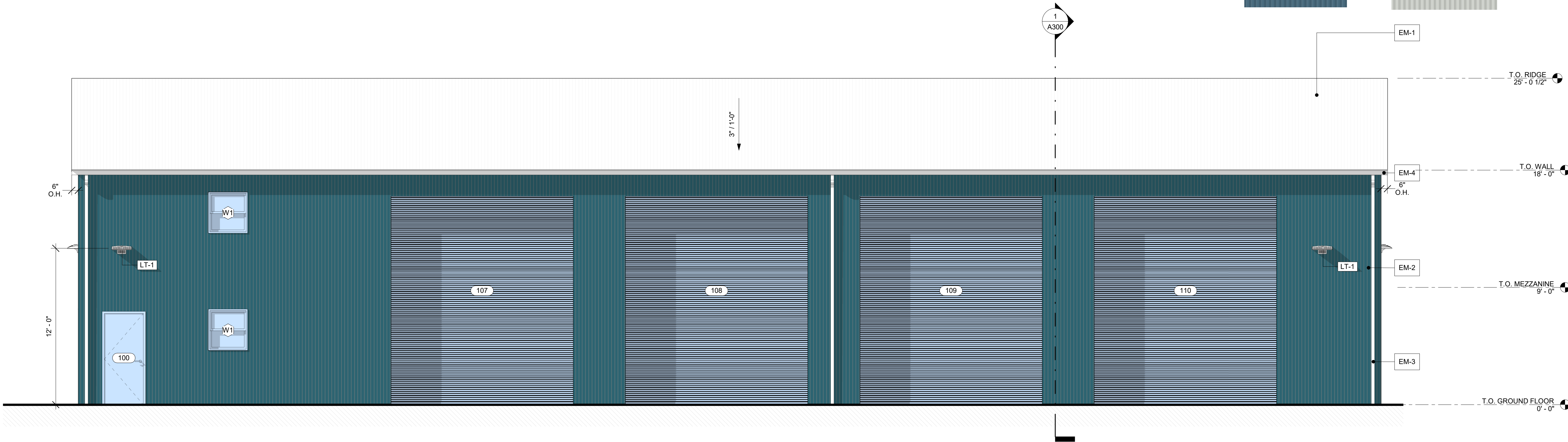
1 EAST ELEVATION 1/4" = 1'-0"